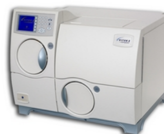
VITEK® 2 Compact

Please Call us or route your enquiry to our e-mail for further information